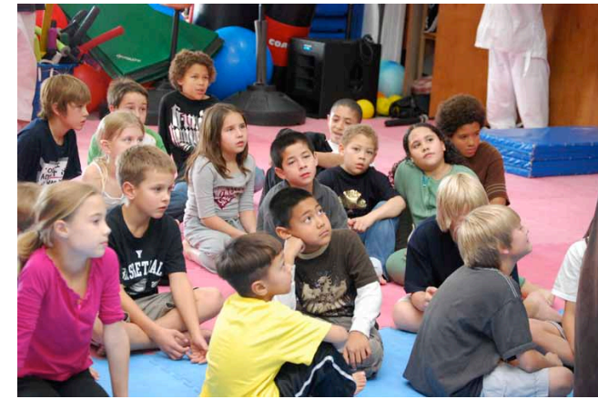
Patience and focus