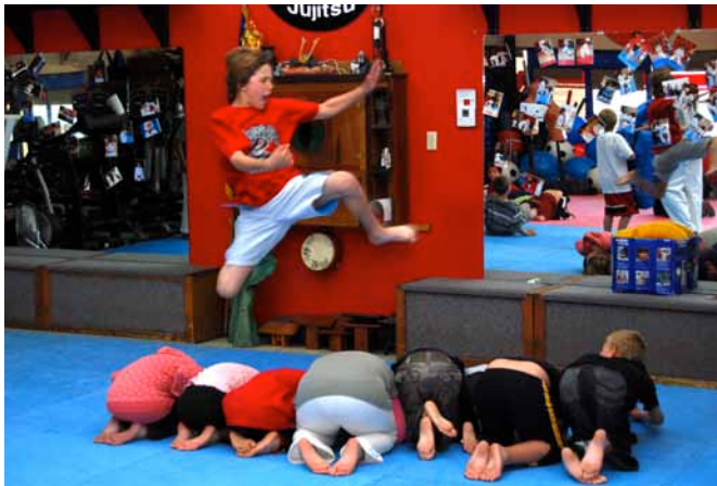
The courage to do incredible things